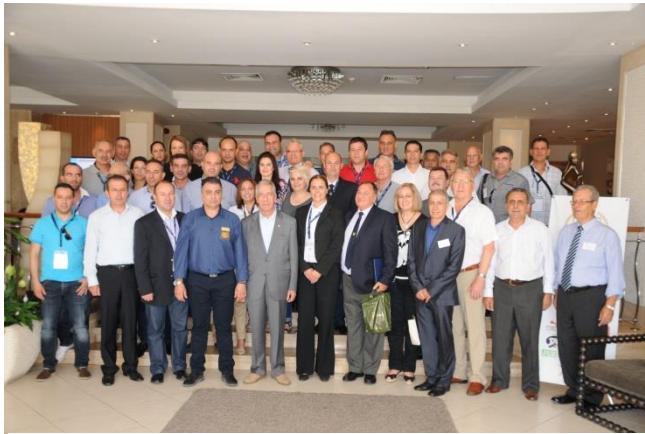
Delegates of IPA Cyprus together with the visiting foreign delegations

The 33 rd Annual Congress of Section Cyprus was hosted this year by the region of Limassol, between 27-30 October 2016.