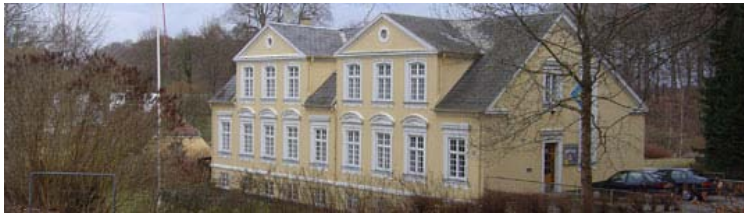
IPA House Arresøhus, Denmark

Visitors shall be offered a programme, which will take them around Copenhagen and parts of Zealand showing highlights of Danish culture and history. This programme is part of the conference price.