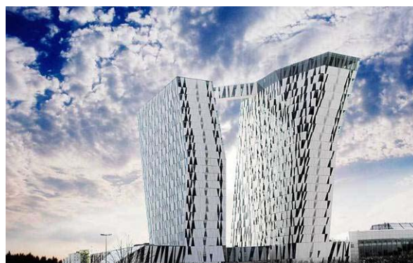
Hotel Bella Sky, Copenhagen

You shall be accommodated in one of Copenhagen's newest and most inspired and inspiring hotels, the Bella Sky.